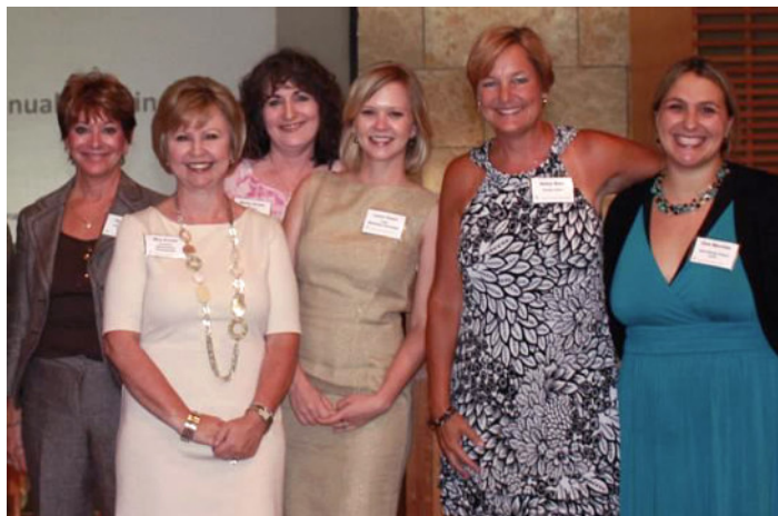
Members at the 2011 Annual Meeting

As of 2011 we have distributed $3,154,000 back into our community.